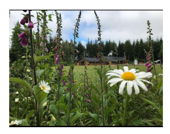
NOVEMBER 25, 26, 27, 2022