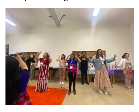
Praise and Worship Dance from the Youth