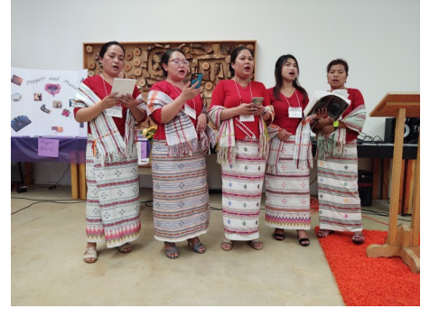
Special song from the Matu Women

Fellowship with the wonderful women of ABW-PNW